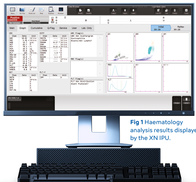
Fig 1 Haematology analysis results displayed by the XN IPU.

More than 1200 haemoglobin variants (Hb variants) have been identified so far [1, 2], which are related to distinct genetic mutations of the haemoglobin \beta -globin gene ( HBB gene) and are leading to different structures and biochemical properties (e.g. oxygen affinity) of the haemoglobin molecule [3]. While the largest portion of haemoglobin variants have no clinical effect, approximately 150 unstable Hb variants are known to cause haemolytic anaemia of varying severities [1, 2, 4-6].